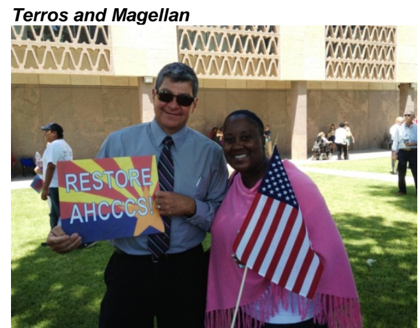
Valle del Sol