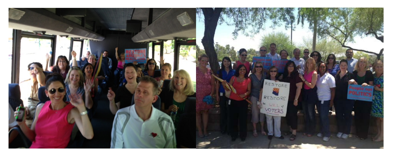
Mercy Care Plan