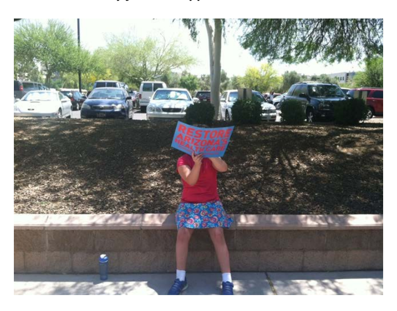
"This is one I rally for and support!"

Over 400 organizations and businesses support the Governor's Plan, as well as Arizonan's from across the state! Add your photo to the gallery by e-mailing <a href="mailto:Share@azahcccs.gov">Share@azahcccs.gov</a>.