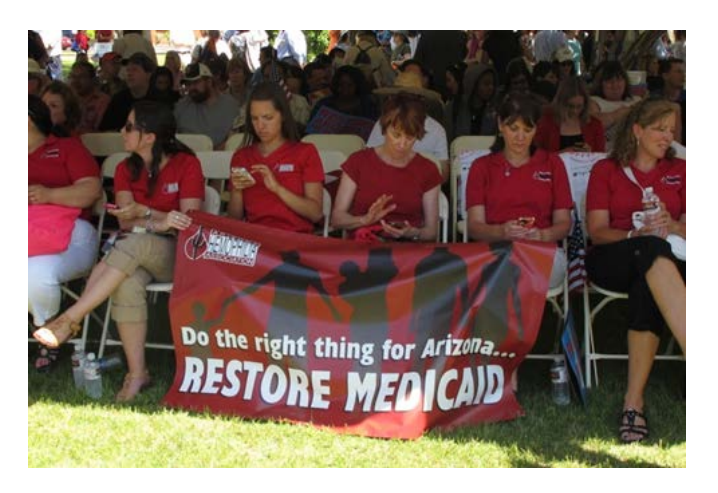
Care 1<sup>st</sup> Health Plan Arizona