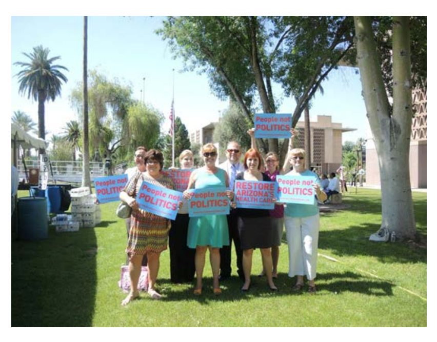
American Cancer Society Cancer Action Network